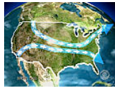
What's causing chaotic spring weather?