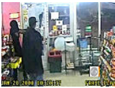
Good Samaritan injured during robbery