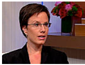
American hiker describes Iranian prison abuse