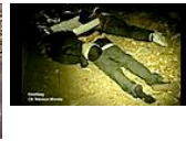
Grim warning after bodies found