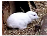
Rabbit in Japan born with no ears